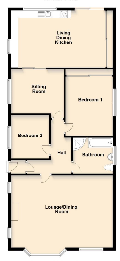
Floor plans are for illustration only and not to scale Plan produced using PlanUp.